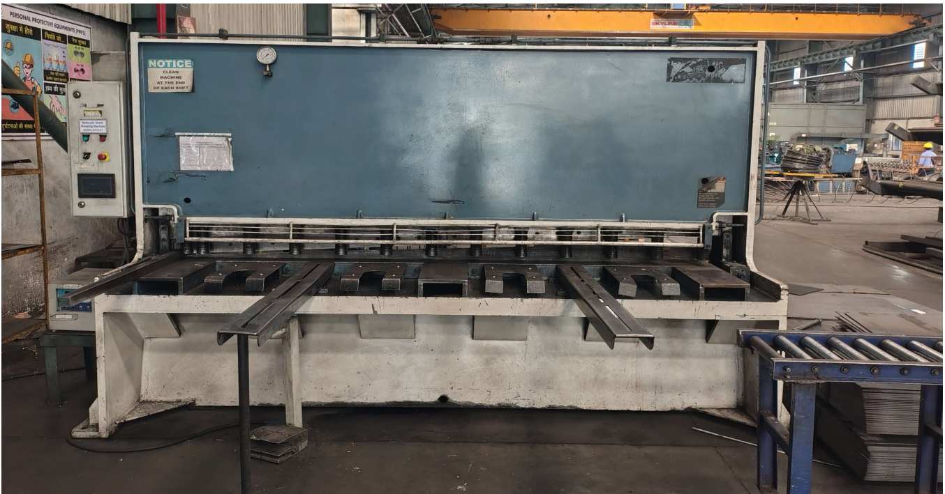
Shearing Machine for Steel Laminates

Designer, Manufacturer and Installer of Pot Bearings, Spherical Bearings, Elastomeric Bearings, Metallic Bearings, Expansion Joints, Post Tensioning Systems, High Strength GEO Strap, GEO Composites and allied accessories.