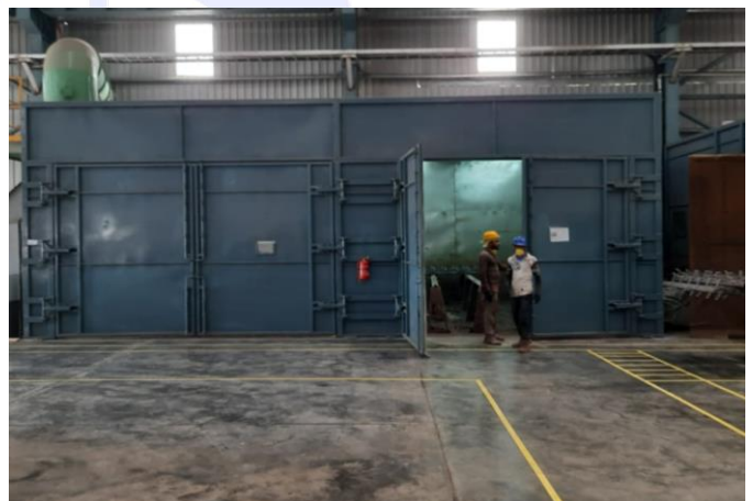
Water Less Paint Booth

Designer, Manufacturer, and Installer of all types of Bridge Bearings, Expansion Joints, Post Tensioning Systems, High Strength GEO Straps & GEO Composite, and allied accessories.