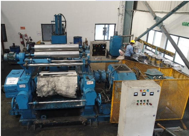
Rubber Mixing & Milling Machine