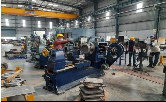
Conventional Machine Area

Office & Works: 73 B, Sector C, Industrial area, Mandideep, Bhopal (M.P.) INDIA-462046 CIN: U45200MP2008PTC044683