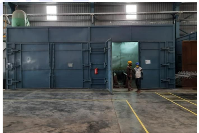
Water Less Paint Booth

Designer, Manufacturer, and Installer of all types of Bridge Bearings, Expansion Joints, Post Tensioning Systems, High Strength GEO Straps & GEO Composite, and allied accessories.