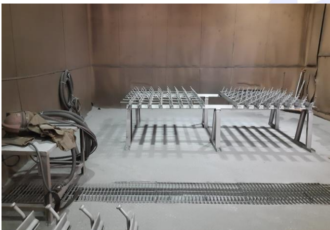
Shot Blast Room