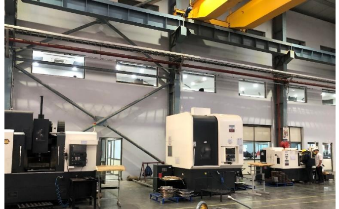
CNC Machine Area